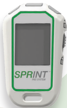
SPRINT Pulse Generator