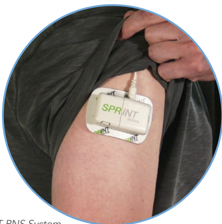
SPRINT PNS System (in place on shoulder)

In fact, most people who experienced SPRINT reported significantly less pain long after the lead was withdrawn.